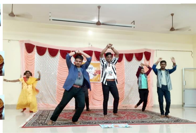
Folk Dance - IDPC