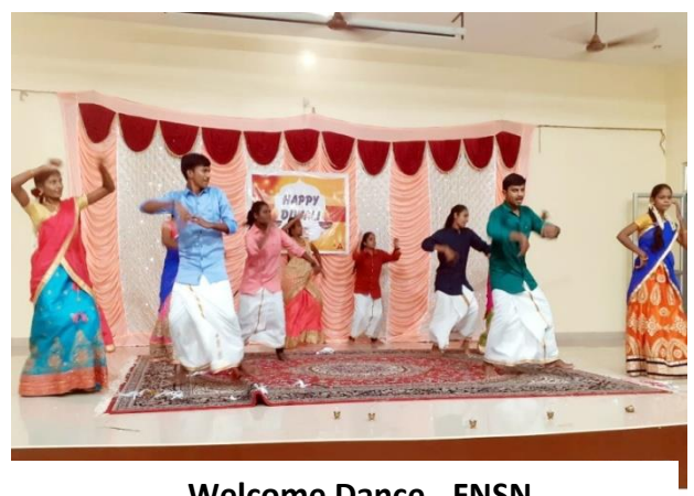
Welcome Dance - FNSN