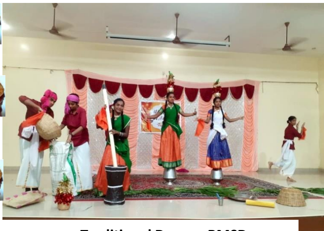
Traditional Dance - RMSD